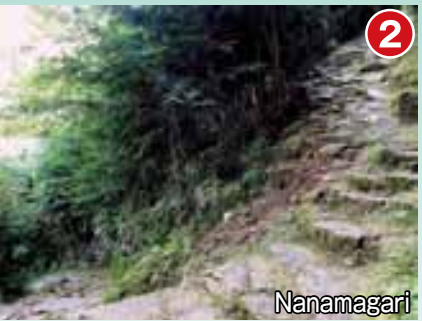
This is the steepest slope on this route, the most difficult on the route to Kumano from Ise. The stone steps seem to keep climbing on and on endlessly.

From these gravestones you can see how widely popular this pilgrimage route was. The first grave belongs to a man from Ibaraki (500km NE), the second from Nagasaki on the southern island of Kyushu (800km W) and the third from Hiroshima (500km W). Sadly, some of the pilgrims couldn't survive the journey, but local people generously gave them a proper burial.