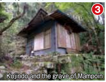
Many pilgrims came here to worship here before starting the Saigoku Kannon Pilgrimage of 33 Buddhist temples worshiping deities of mercy. Nearby stands the grave of an ascetic mountain priest who came to here to drive out the bandits on this stretch of the road.