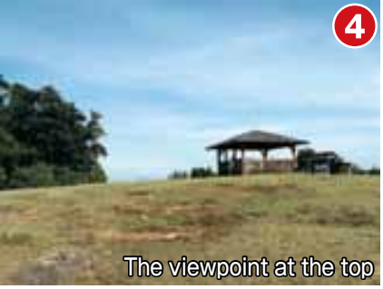
On a clear day, there is a magnificent view up and down the coast. There is an arbor so you can have lunch out of the rain when the weather is bad.