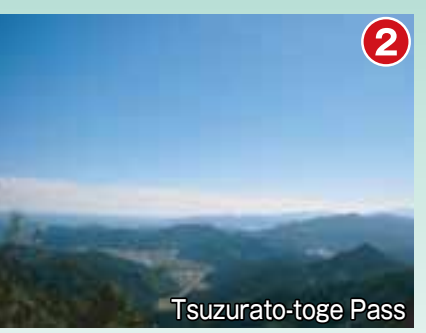
Elevation 357 meters. This is the first point where pilgrims heading to the Kumano Three Grand Shrines first get a look at the Sea of Kumano.