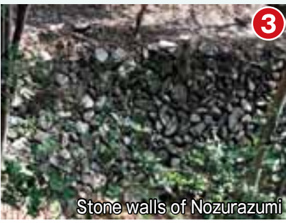
Along the valley, you can see stone walls here and there. Their history goes way back, and they have protected the road from years and years of wind and rain erosion.