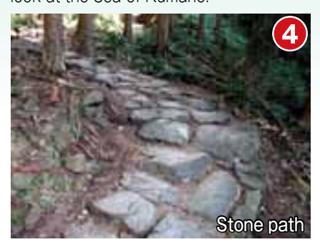
The stone path zig-zags its way through the plush green of the ferns, it almost looks like stitching by a seamstress.