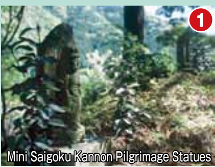
The dethroned Emperor Kazan on a pilgrimage to Kumano came here and set up a miniature version of the Saigoku Kannon Pilgrimage of 33 Buddhist temples worshiping deities of mercy. The 33 statues of mercy here on this miniature version represent each of the temples on the official pilgrimage.