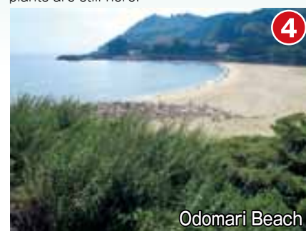
The beautiful sand beach, the islands off the coast and the rocky point called "Oni ga Jo" or Demon's Castle make for a breathtaking view.