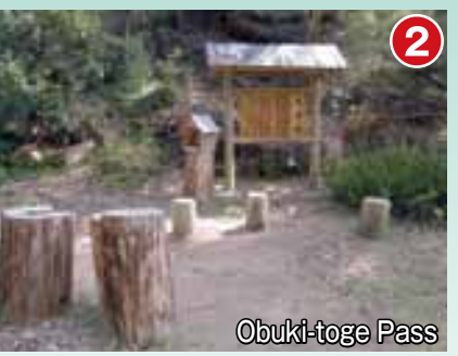
The Obuki Tea House was open for business here until about 1950. They would wrap rice balls and sushi in the leaves of plants called "baran" and "hanamyoga" which they planted here. The tea house is long gone, but the plants are still here.