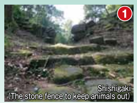
Just before you get to the pass, you will see a wall put up about 300 to protect the rice paddies and fields from wild boars and deer.