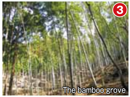
From Obuki Pass, a gentle slope descends through a peaceful beautiful bamboo grove. In February and March you can see the new shoots and places where the wild pigs have dug up this delicacy among people and boars alike. The steps can be guite slippery, watch your step.