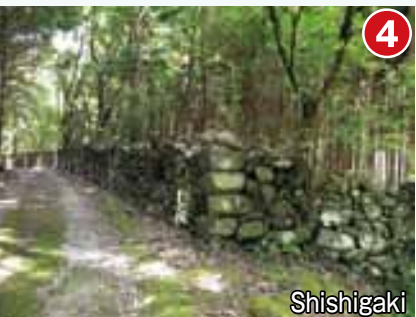
Just after you leave the forestry road, you should see a short stone wall called a "shishigaki" paralleling the path. This was built to keep wild boar from ravaging the crops.

This is the perfect place to take a break with a spectacular view. Two poems written by the travel writer Suzuki Bokushi in the Edo period (1603 - 1868) are written on boards put up here.