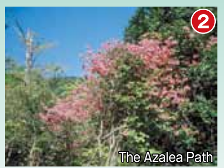
In April and May this grove of azaleas come in full bloom, accented by the young green leaves of spring. You can enjoy any season in this well-lit woodland with its many types of trees.