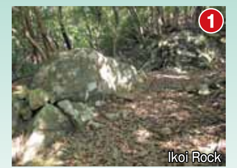
Travelers always used this rock as a bench, so it got the name, "Ikoi Ishi" or The Rest Rock. The cool wind coming over this ridge makes it an excellent place to take a break.