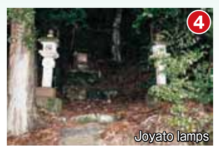
They say that long ago that this was used as a road marker for travelers, while some believe these lamps marked holy places.

Some say that this statue of a guardian deity was put up and worshiped to protect travelers while another theory claims that there was an epidemic here and it was put up to keep the sickness from spreading. Which is true is lost in history.