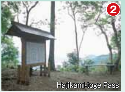
Elevation 147 meters. There used to be a tea house here where travelers could take a break. All that is left now is the foundation.

The islands of Kii Matsushima seem be floating in the sea of Kumano makes for a spectacular view. On a clear day you can see all the way to the Shima peninsula 45km to the NE.