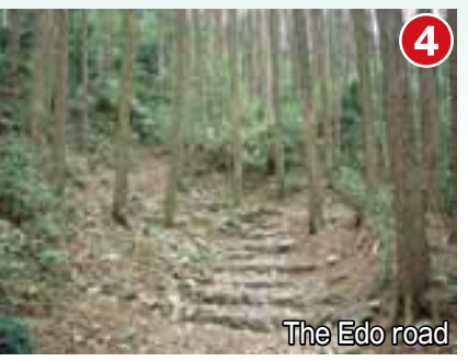
These steps are only paved with stone on the front edge. On a rainy day the road would get muddy and straw sandals (the common footwear of the day) would require periodic cleaning. In several places along the way, you can find drainage gutters crossing the path, which both protected these roads from erosion and provided a place to wash the mud out of your sandals.