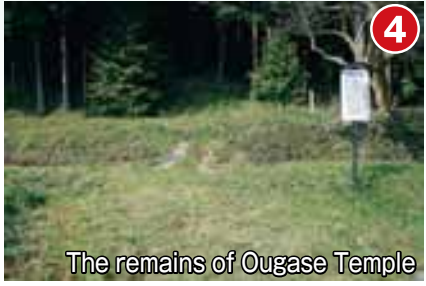
The temple which stood here long ago was built by the order of Emperor Shotoku in the year 766. Roof tiles and other artifacts dating from the Nara period (710 to 794) were excavated from the area.