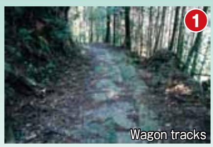
Long ago, wagons used to use this part of the route. It is easy to see their tracks even now.