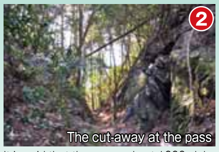
It is said that they carved out 1000 slabs of graphite to clear the way for this path. This must have been an enormous amount of work considering the limited tools they had for excavation at the time.