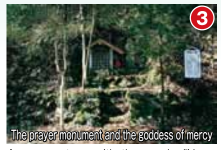
A prayer stone with the words, "Namu Amida Butsu" (a mantra repeated in order to never forget Buddha's grace). A statue of a guardian of mercy is enshrined inside the small shine.